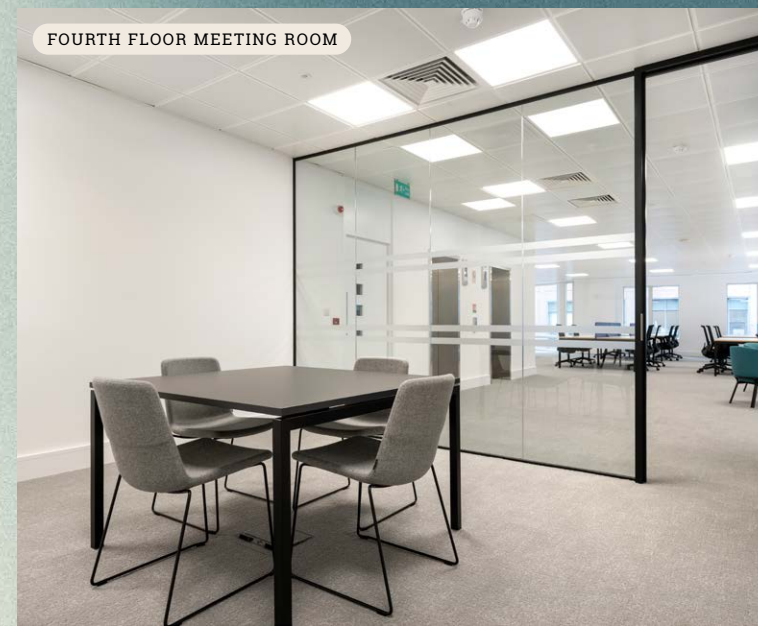
FOURTH FLOOR MEETING ROOM