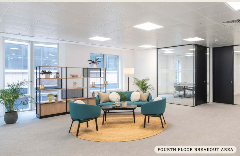
FOURTH FLOOR BREAKOUT AREA

Floorplans not to scale. For indicative purposes only.