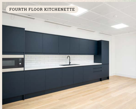
FOURTH FLOOR KITCHENETTE